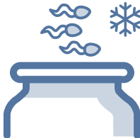
Sperm Freezing further visits if required